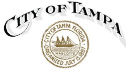
Bob Buckhorn Mayor